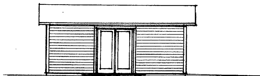
FASAD MOT VÄSTER